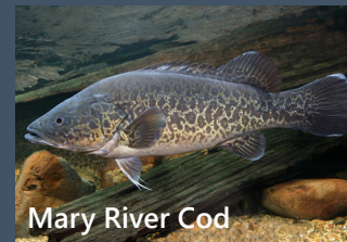
Mary River Cod