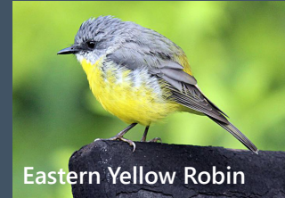
Eastern Yellow Robin