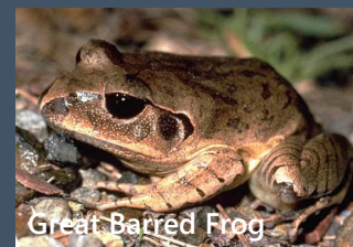
Great Barred Frog