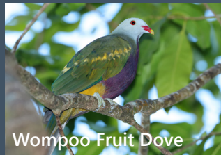
Wompoo Fruit Dove