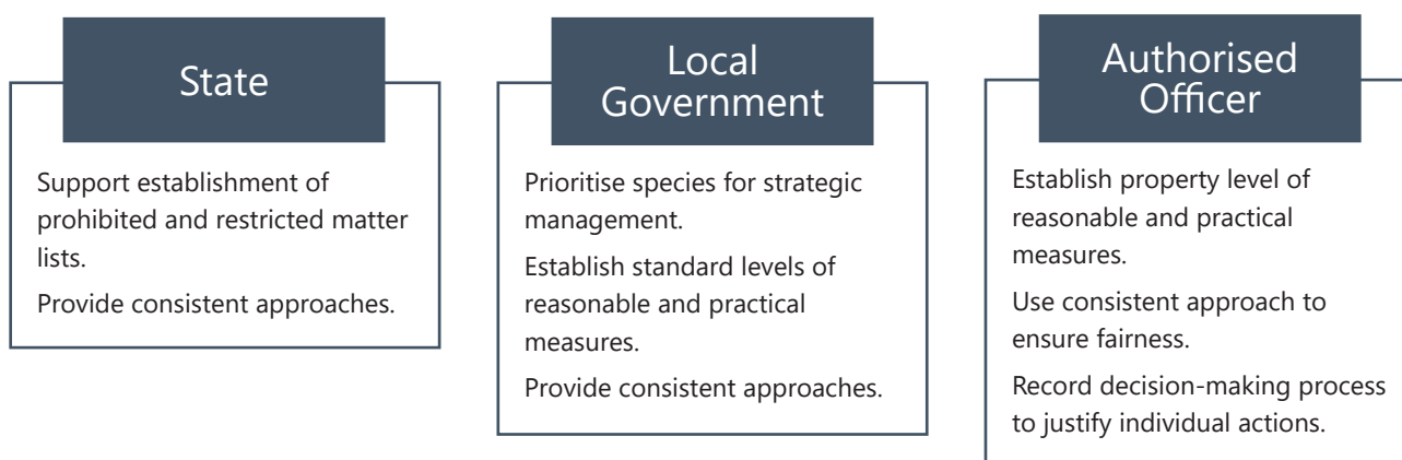
Figure 2. Risk-based decision-making applied at the state, local government and authorised officer levels.

Council biosecurity officers (CBOs) make decisions using professional experience, and based on an assessment of the biosecurity risks related to the individual situation. This information is recorded on council's Biosecurity Information System. Documenting the reasons for a decision provides a chain of evidence which is used as evidence to support decision making.