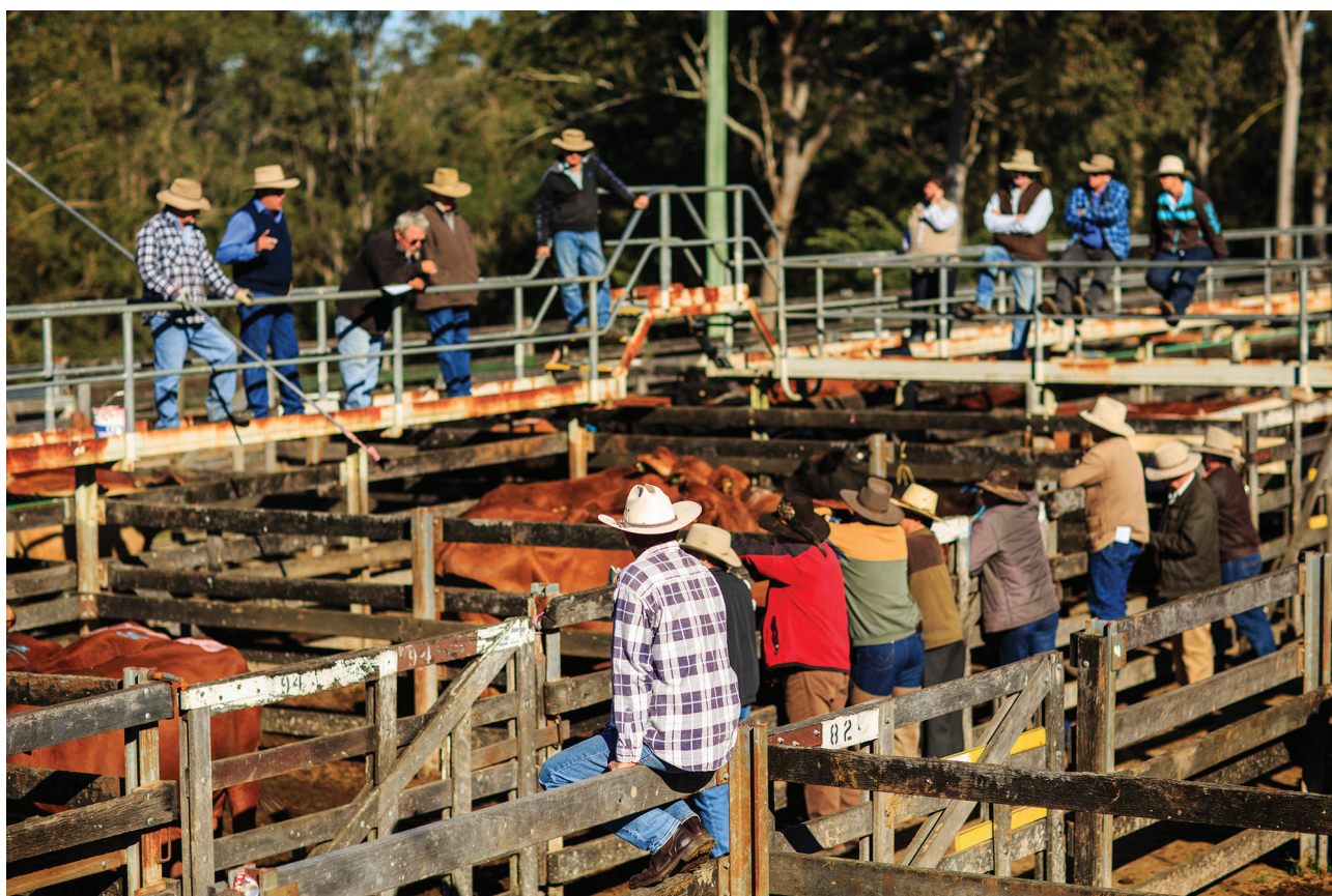
Photo: Gympie saleyards

Examples of measures that could be practically achieved and would reasonably be expected to manage a weed or pest animal to meet a specific management goal is provided in Table 4 of the Plan.