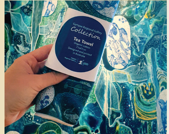
Cover image: Marni Stuart, After the Fire (detail), 2022.

Discover unique, hand-crafted treasures by local and regional artists, available during normal gallery hours.