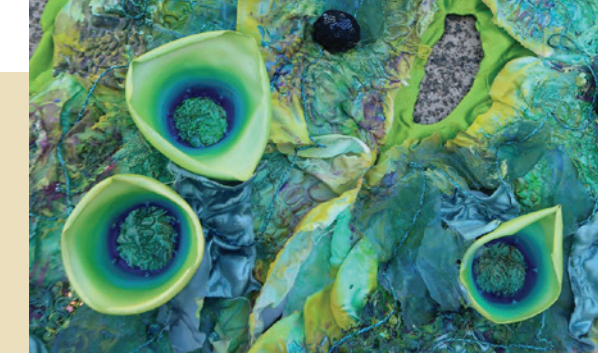
Svenja, Kaleidolichen (detail), 2023.