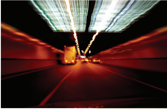
Callum Heinjus, Airport Orange (detail), 2014.