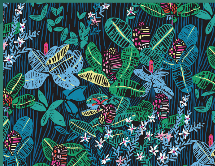
Marni Stuart, After the Fire (detail), 2022.

This project was made possible by funding from the Queensland Government through Arts Queensland, and through RADF. The Regional Arts Development Fund is a partnership between the Queensland Government and Gympie Regional Council to support local arts and culture in regional Queensland.